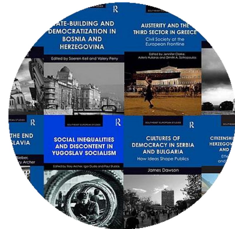
Routledge book series Southeast European Studies