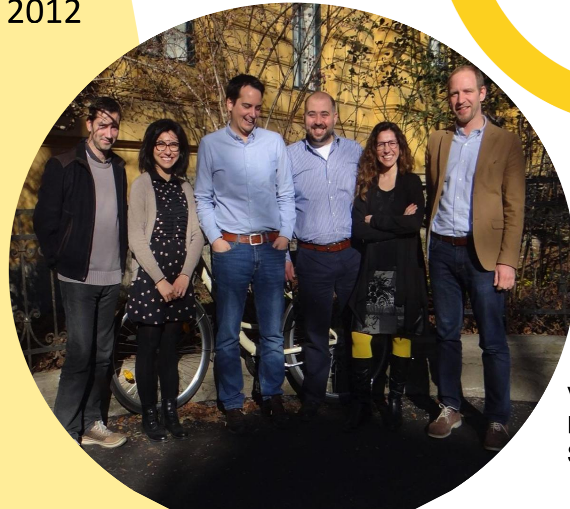
Visiting Fellows Summer 2016