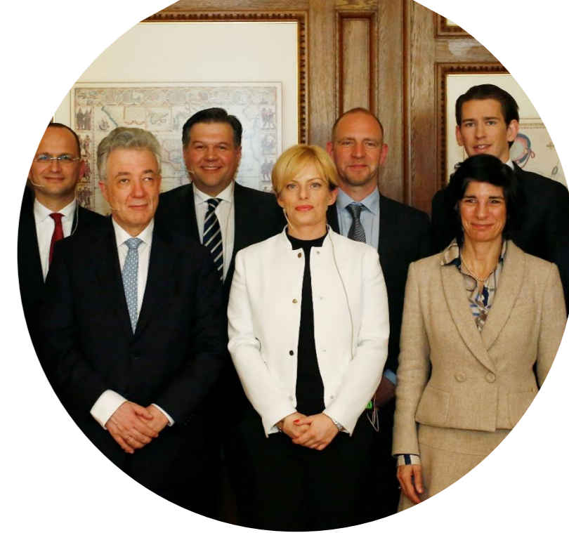
BiEPAG with Austrian and Western Balkans Foreign Ministers, 2016